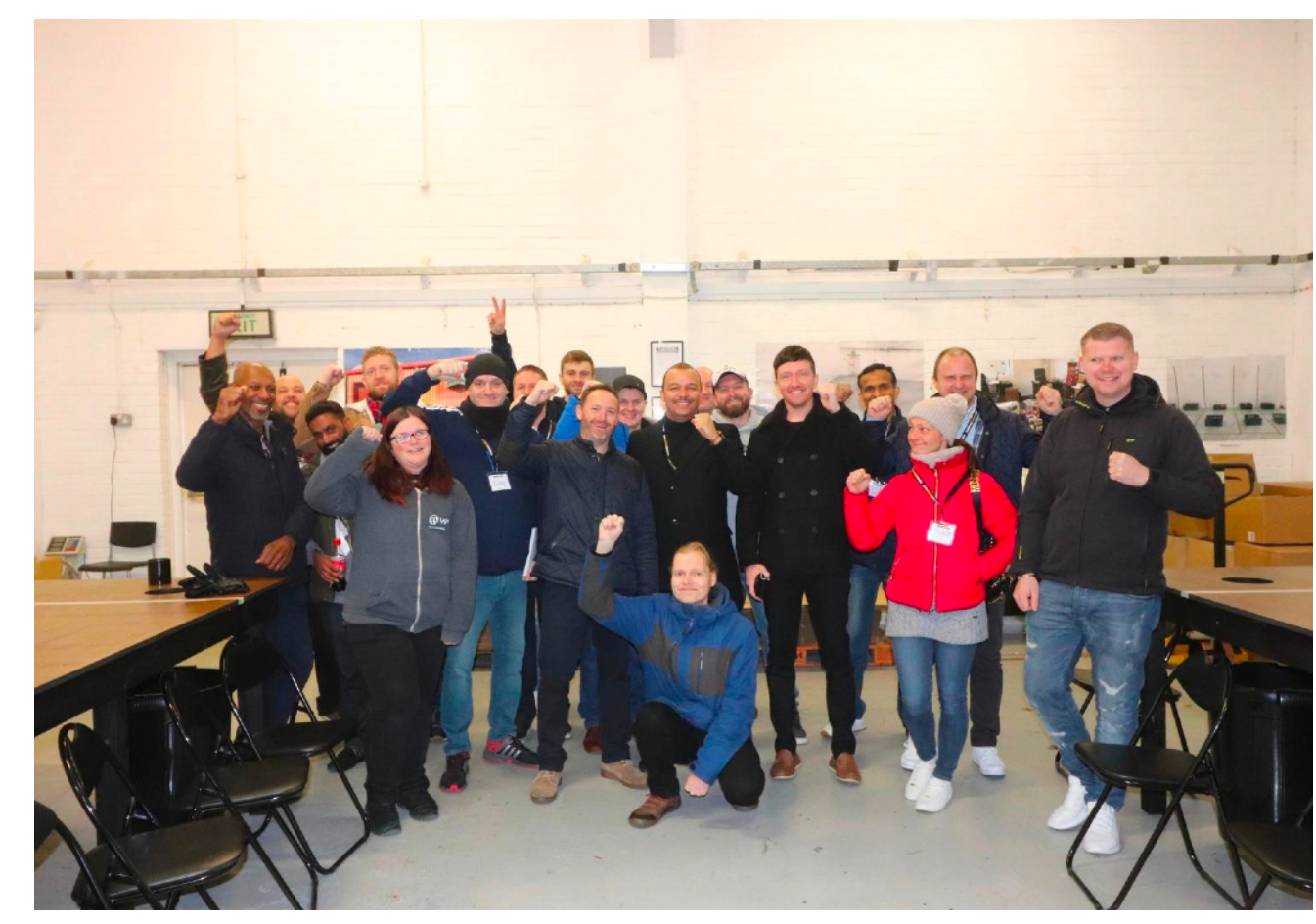
Winning Together - Magic Mastermind Moments - Lasting Relationships